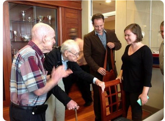
Sharing stories at SYC